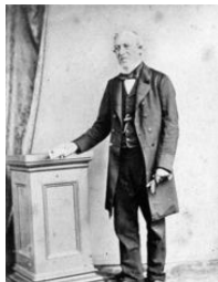
John Septimus Roe, 1870