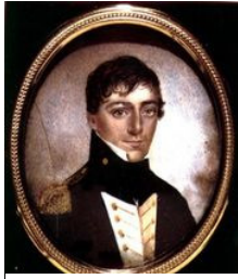
John Septimus Roe, 1824